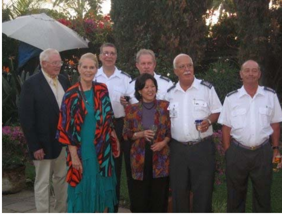
Wing Executive and Guests